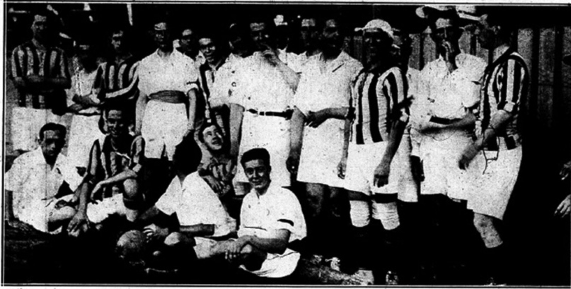
Figure 4. Alfonso XIII and San Juan FC players. Puerto Rico Ilustrado , August 21, 1920, npn.