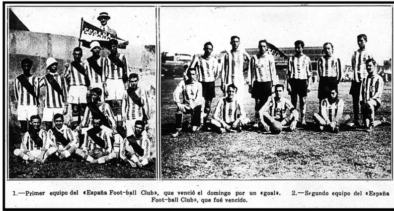
Figure 2. Taken from Puerto Rico Ilustrado , March 20, 1915, 6. Photographer unknown.

cheerful. The sun brightened the emerald color of our countryside and the multitude of wild flowers . . . it was the train of happiness. To make it more pleasing, along with them traveled gorgeous ladies and charming 'señoritas' . . . Our inexperienced and brave kids from the Arecibo fought with enthusiasm, and defended with the right assiduousness of their race against the friendly and kind kids from the España." 93